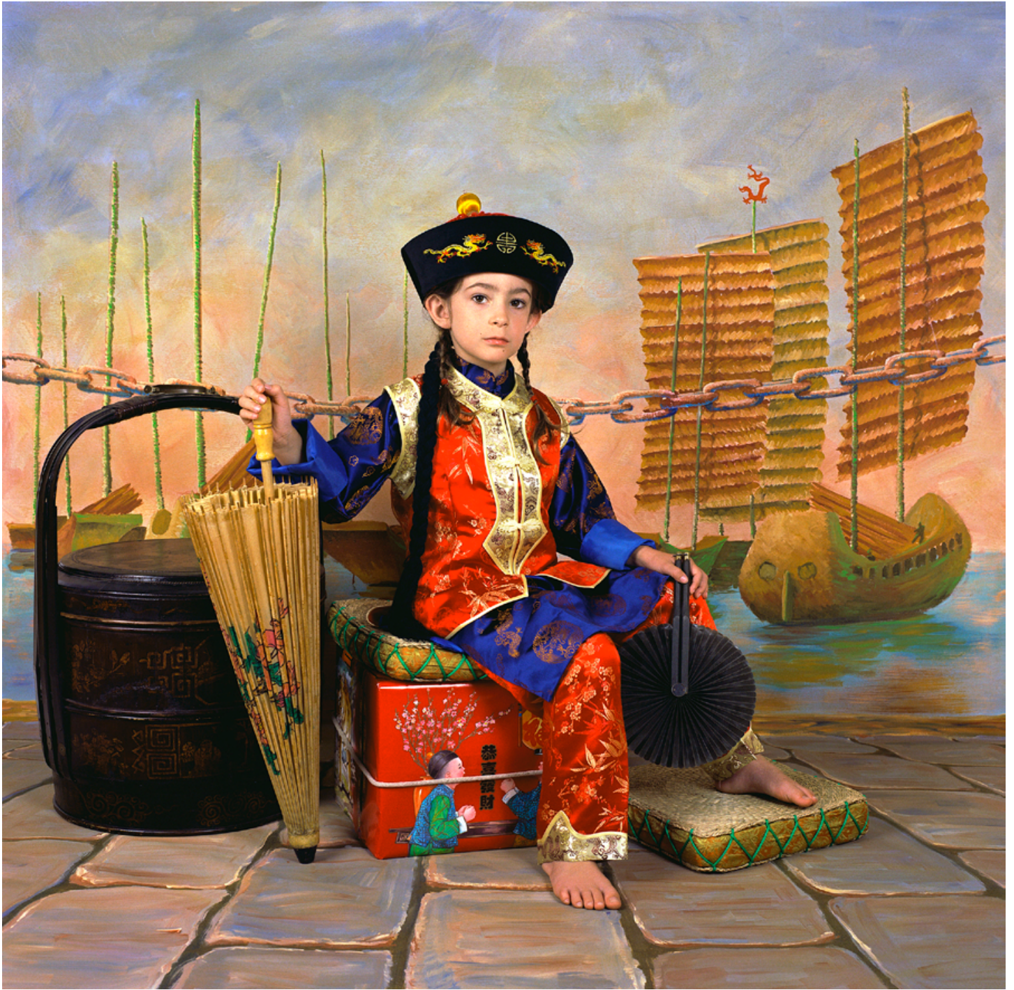
Polixeni Papapetrou Olympia as Lewis Carroll's Xie Kitchin as a Chinaman (off duty) 2003 Type C print Geelong Gallery Sybil Craig Bequest Fund, 2003