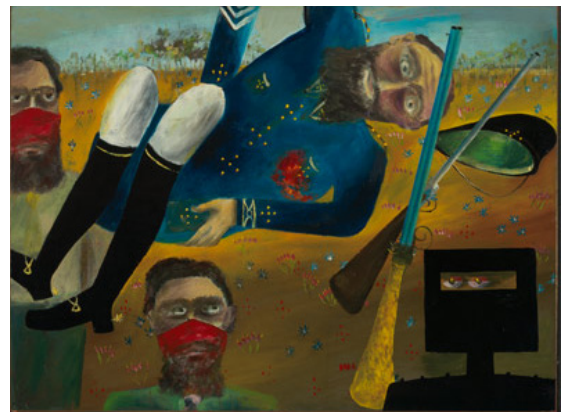
Sidney Nolan Stringybark Creek 1947 from the Ned Kelly series 1946 – 1947 enamel paint on composition board National Gallery of Australia, Canberra Gift of Sunday Reed 1977